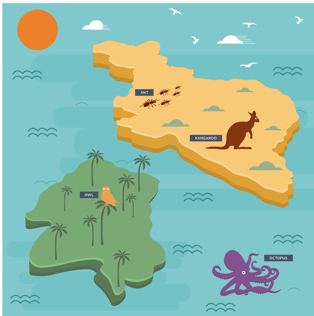
Figure 2. Original draft of the interactive concept map image.

can select to learn about a given governance model further, the background scenery (water and landmasses) was designed to be insignificant. However, youth panelists thought that the positioning of the animal touchpoints communicated the similarity and dissimilarity of animal models to one another. Panelists gathered that the ant and kangaroo models were uniquely similar because they shared a landmass, although this was merely a design choice. This finding indicated to the research team both the utility of testing informational materials prior to deploying them and the possibility for participants to glean information from unintentional semiotic signifiers in the materials.