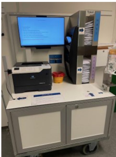
Figure 1. The self-testing technology.

Under the new system, patients who wanted to get tested for chlamydia and gonorrhea would call a nurse trained in the field of venereology, who would conduct a short interview for the patient's medical records. The nurse would then set up the process in the electronic medical record that would give patients access to the STT using their personal identification number. Men were informed about having to self-collect a urine sample, and women about having to self-collect a vaginal swab. How to collect those samples was not elaborated because this information would be provided when patients used the STT. Patients were informed that they had 14 days to take the test within the opening hours of the outpatient drop-in clinic. Furthermore, they were informed about the location of the STT and that in case of a positive test result, they would receive an electronic letter in their secure personal digital mailbox. In case of a negative test, they would not be contacted but would have to check their test result on the Danish national portal for patient communication, a secure digital platform that contains all medical information linked to patients' personal identification numbers. The unique personal identification numbers of all Danish citizens allow us to link medical information in different IT systems in a secure way. When entering the STT system the users will use their unique personal identification numbers and the system will recognize the user as a legitimate user of the system.