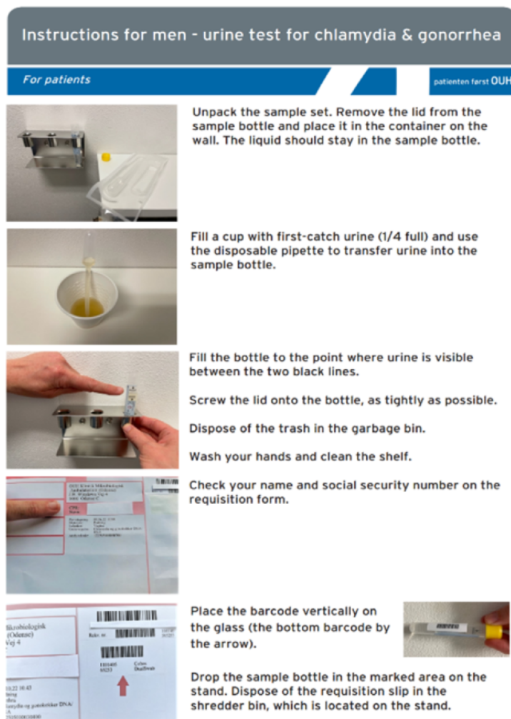
Figure 4. Example of revised instructions for male patients.