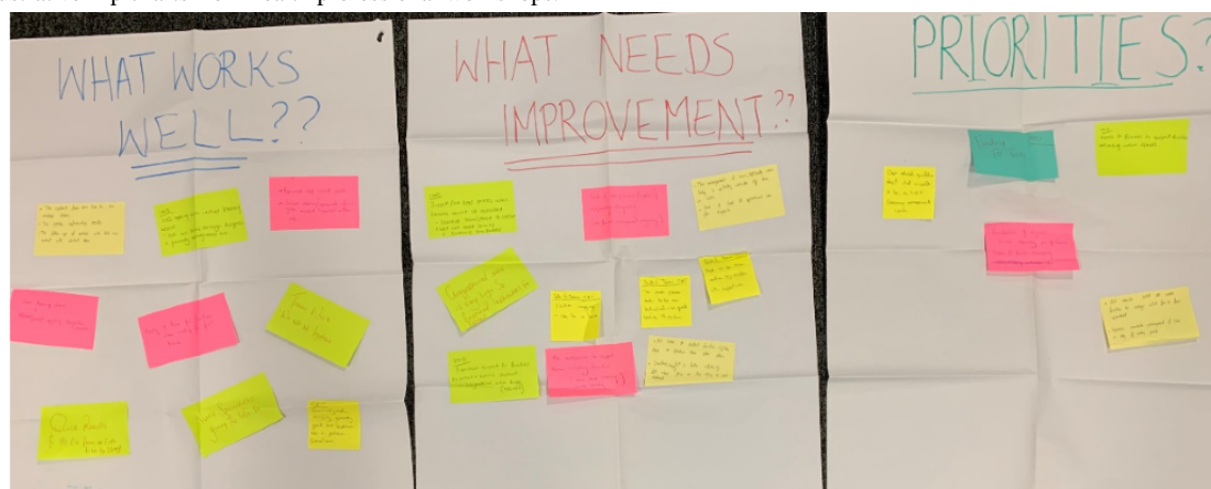
Figure 2. Illustrative flip charts from health professional workshops.

web-based EBCD toolkit [18] and the accompanying web-based resources, including the invitation and agenda template. The findings of the health professional interviews were presented via a Microsoft PowerPoint presentation using direct quotes to illustrate the points made. The participants were encouraged to reflect on what they considered to be working well, what they thought required improvement and, from this, key priorities to improve the communication of positive NBS results to families. Health professionals were asked to record their thoughts on a flip chart paper so it could be shared with the whole group (Figure 2).